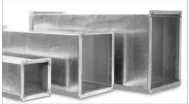
PRE FAB TDF DUCTS